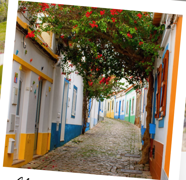
Algarve's vibrant culture