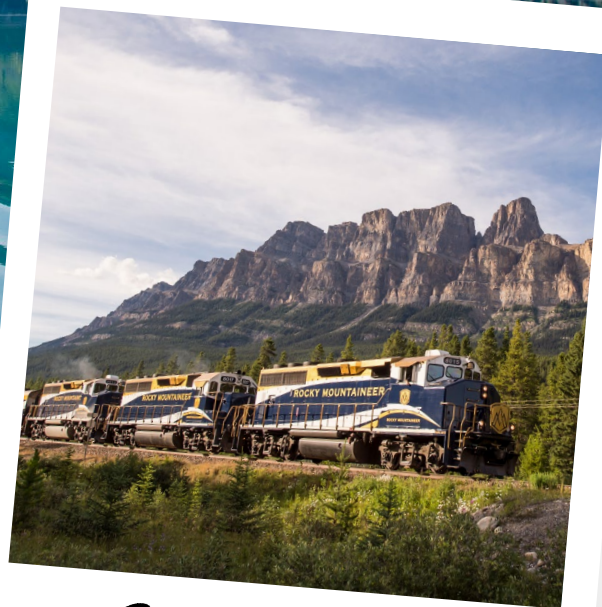
Scenic rail routes