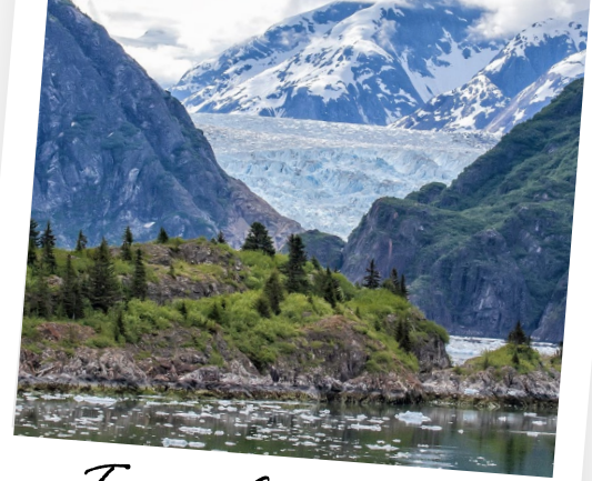
Tracy Arm Fjord