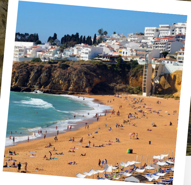
Days by the sea